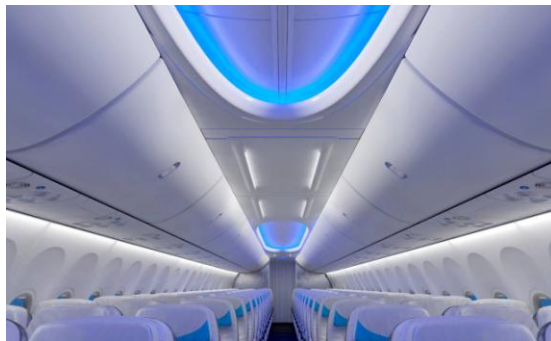
737 Boeing Sky Interior